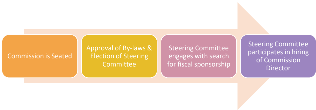
Phases of Community Involvement & Decision-Making in building Commission Infrastructure