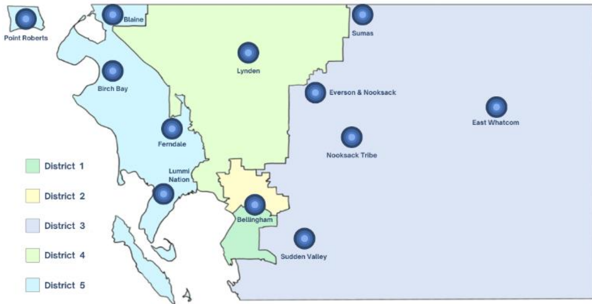
Participants involved development process by Council district.

who had an interest in Whatcom (ex: working or attending school but technically residing in another county.)