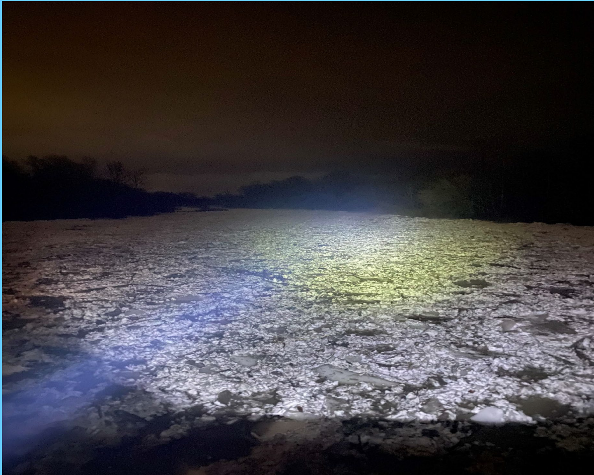
Photo looking upriver from the Marine Drive Bridge about 1:00 AM Christmas Morning