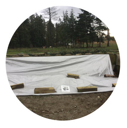
Free Manure Tarp

Use our new online resource to find or share manure