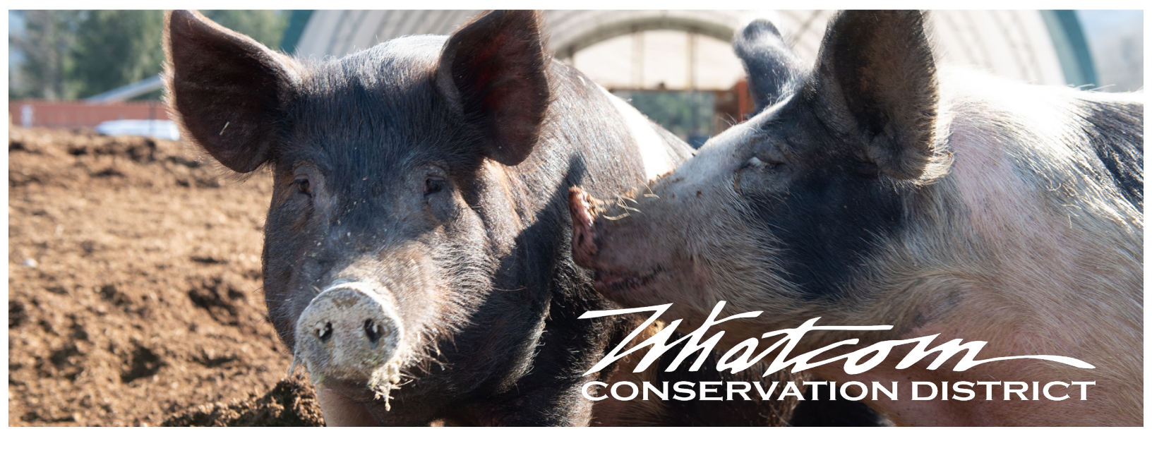
Learn what opportunities exist in addition to our FREE and confidential Whatcom CD farm planning services.