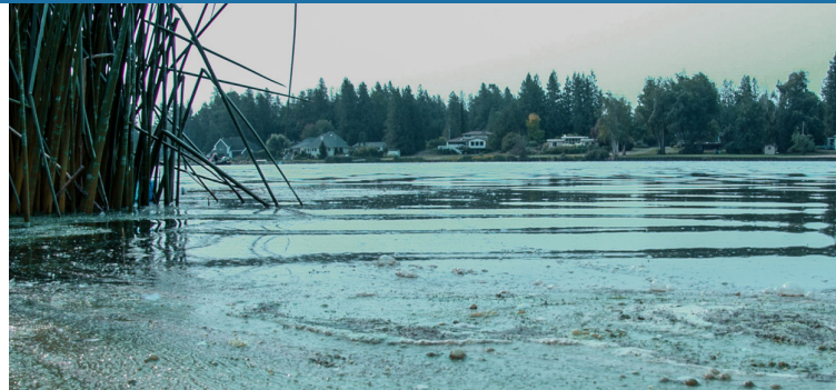
Wiser Lake: Our year-long data collection effort will help understand & mitigate harmful algae blooms.

Cost-benefit estimates show that effective school-based programs can save $18 for every $1 spent.