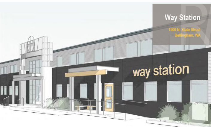
Concept illustration of the State Street Way Station Facility.

Along with our partners, we look forward to opening the doors of the Way Station this fall. The Way Station, located at 1500 State Street in Bellingham, will offer respite beds for individuals exiting the hospital, hygiene services, medical and behavioral health care and connections, as well as case management and referral services. These services will be provided by PeaceHealth, Opportunity Council, and Unity Care NW. The second floor will co-locate Whatcom County EMS and WCHCS teams including syringe services, GRACE and LEAD.