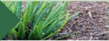
Whatcom Water Alliance Spring 2023 Toolkit