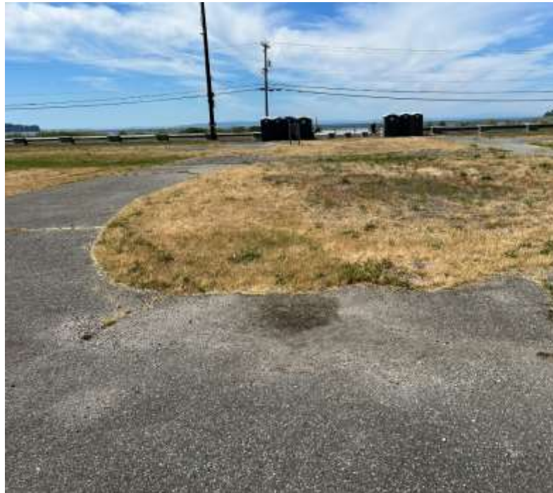
Birch Bay Community Park Whatcom County Parks & Recreation Department Preferred Master Plan