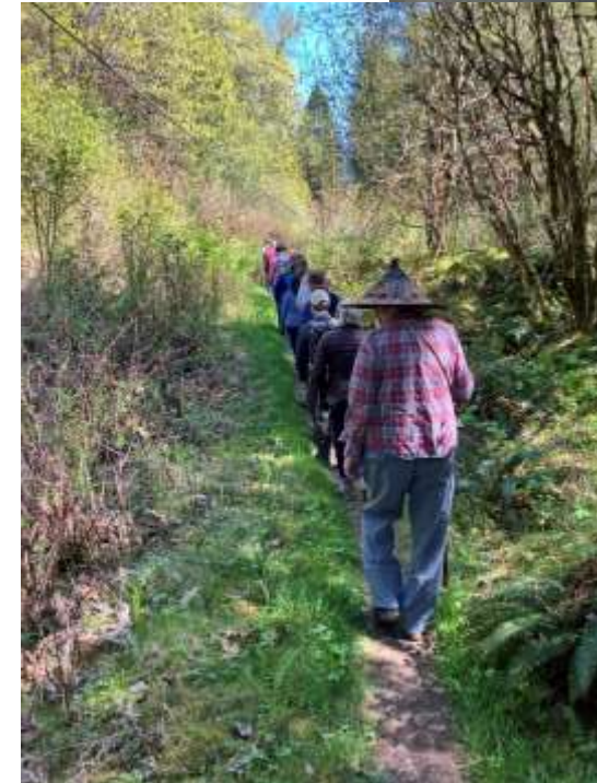
Bay to Baker Trail