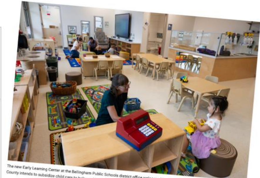
The new Early Learning Center at the Bellingham Public Schools district office welcomed its first group of kids this September. Whatcom County intends to subsidize child care to help working families and providers.