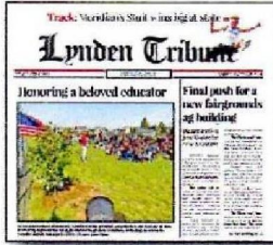
Weekly (every Wednesday)