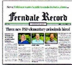
Weekly (every Wednesday)