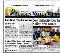
Monthly (first of the month)