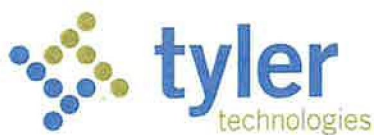
Exhibit D Third Party Terms

DocOrigin Terms. Your use of Tyler Forms software and forms is subject to the DocOrigin End User License Agreement available for download here: https://eclipsecorp.us/eula/ . By signing a Tyler Agreement or Order Form including Tyler forms software or forms, or accessing, installing, or using Tyler Forms software or forms, you agree that you have read, understood, and agree to such terms.