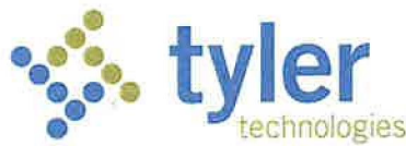
Exhibit C SERVICE LEVEL AGREEMENT