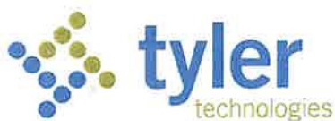
Exhibit A Investment Summary

The following Investment Summary details the software and services to be delivered by us to you under the Agreement. This Investment Summary is effective as of the Effective Date, despite any expiration date in the Investment Summary that may have lapsed as of the Effective Date.