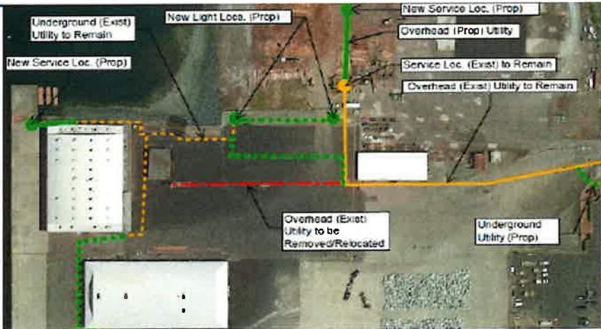
Schematic of Improvements