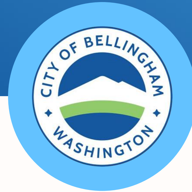
City of Bellingham