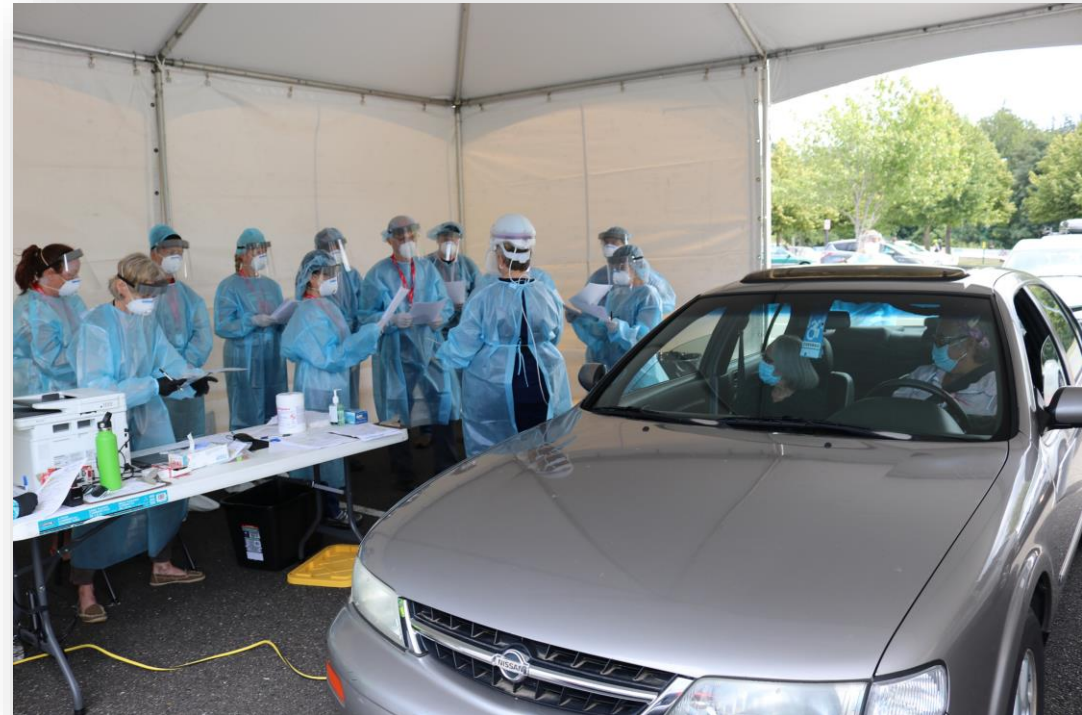
The Whatcom County MRC doing COVID Vaccinations