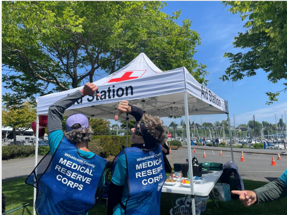
The Whatcom County MRC also holds first aid booths at local non-profit events, like Ski to Sea

The Medical Reserve Corps is a national network of 300,000 regional healthcare provider volunteers in 800 Units. These community volunteers work to strengthen local public health, reduce vulnerability, and build capacity.