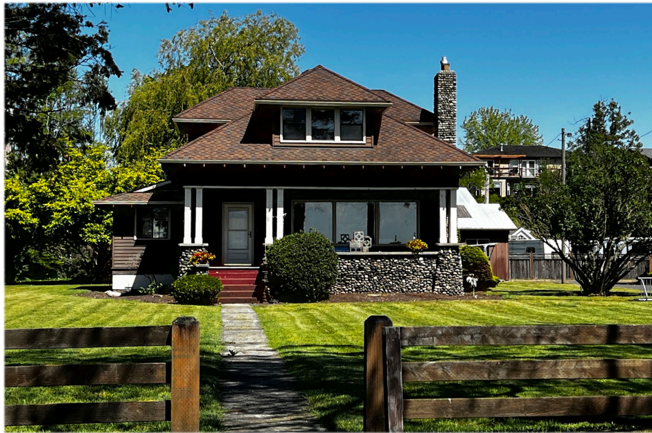
The future home of the Birch Bay Vogt Library Express