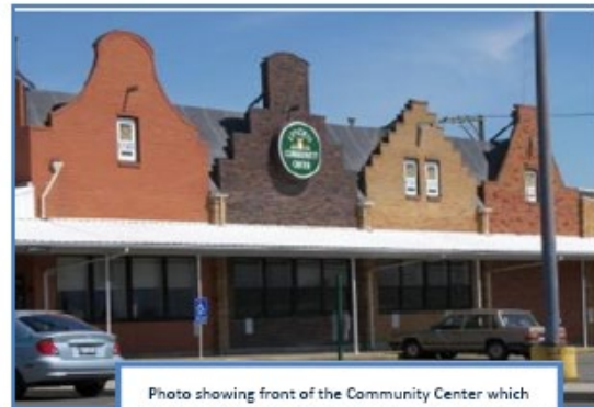
Photo showing front of the Community Center which requires seismic upgrades and major mechanical repairs