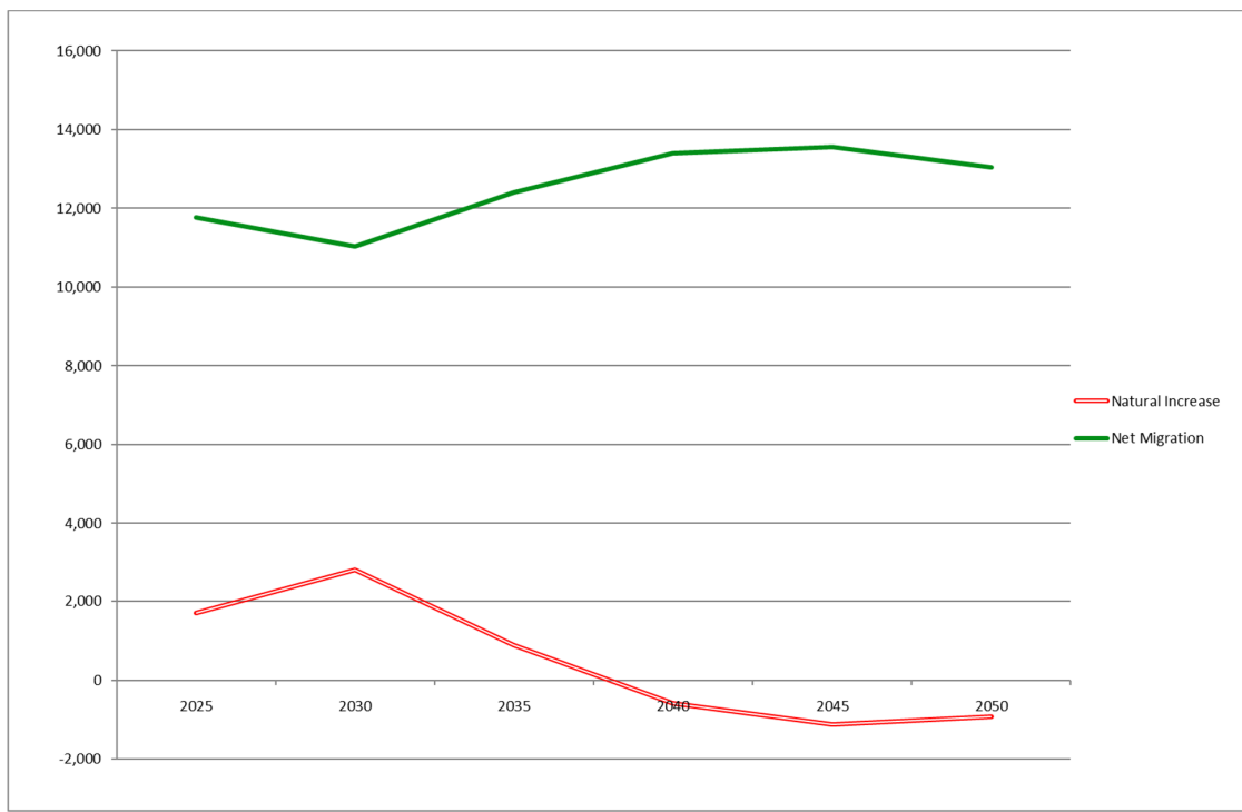
Figure 2. Natural Increase and Net Migration in Whatcom County (2025-2045)

Source of information: Washington State Office of Financial Management (2022)