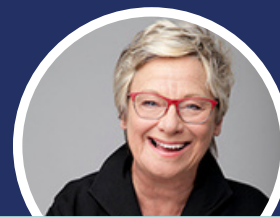
Former Legislator and Mayor DEB EDDY