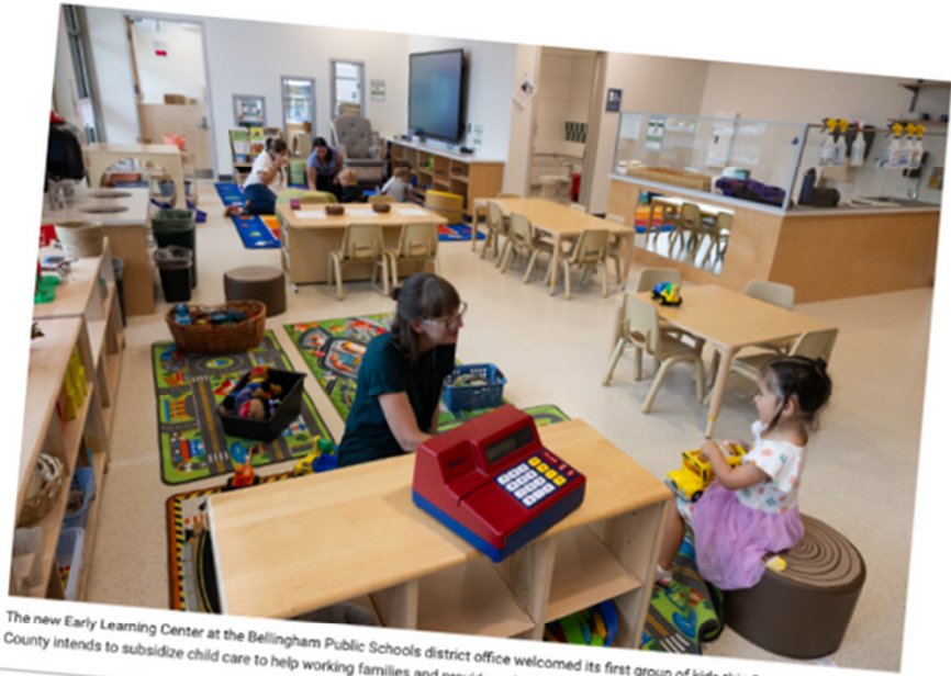
The new Early Learning Center at the Bellingham Public Schools district office welcomed its first group of kids this September. Whatcom County intends to subsidize child care to help working families and providers.