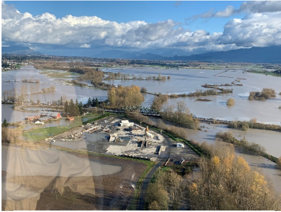
Nooksack River floodplain looking upstream of Guide-Meridian, Tuesday around noon.

Levees. All major levees inspected. Critical damage at Twin View (Lynden), Timon, and Rainbow Slough (Lummi Peninsula) undergoing emergency repair by US Corps of Engineers beginning today. Substantial damage to Lynden Levee, Polinder Levee, Marine Drive Levee, and Saar Creek Berm to be repaired in-house.