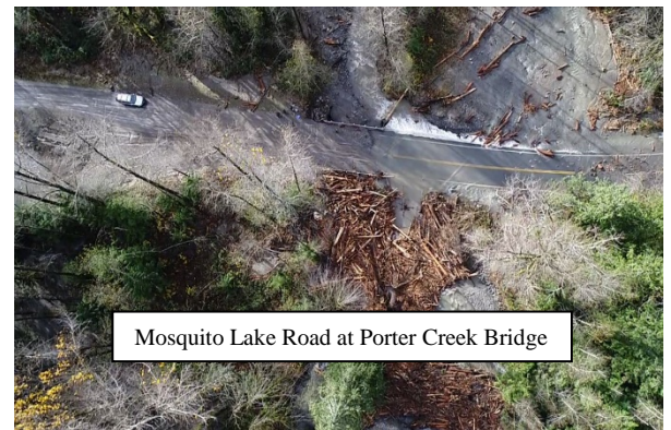
Mosquito Lake Road at Porter Creek Bridge

Roads. All arterials, 80% major and minor collectors and 50% of minor access roads inspected. Ten major repair projects on currently impassable roads including Birch Bay Lynden, Northwest, Drayton Harbor, Goshen, North Fork, Silver Lake, South Pass, Sunset, and Beach are being handled by our Engineering Division. A total of 15 roads remain completely closed.