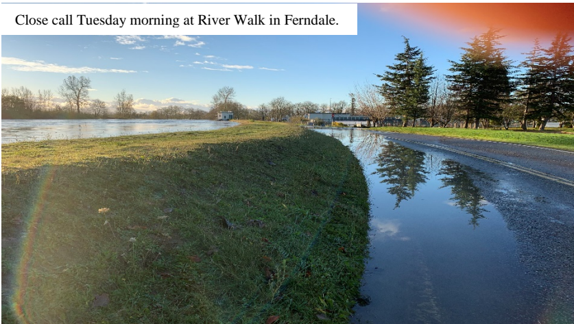
Close call Tuesday morning at River Walk in Ferndale.

Damages falling outside of these definitions will be addressed after critical infrastructure is stabilized and repairs are scheduled. Non-critical work will be scheduled among other priorities as time allows. A preliminary estimate is in excess of two months before we get to non-critical work