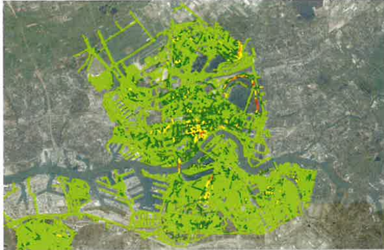
Figure 1: Green shows high positional accuracy, red is poor positional accuracy due to minimal GPS/IMU signal under urban canyons and dense vegetation.