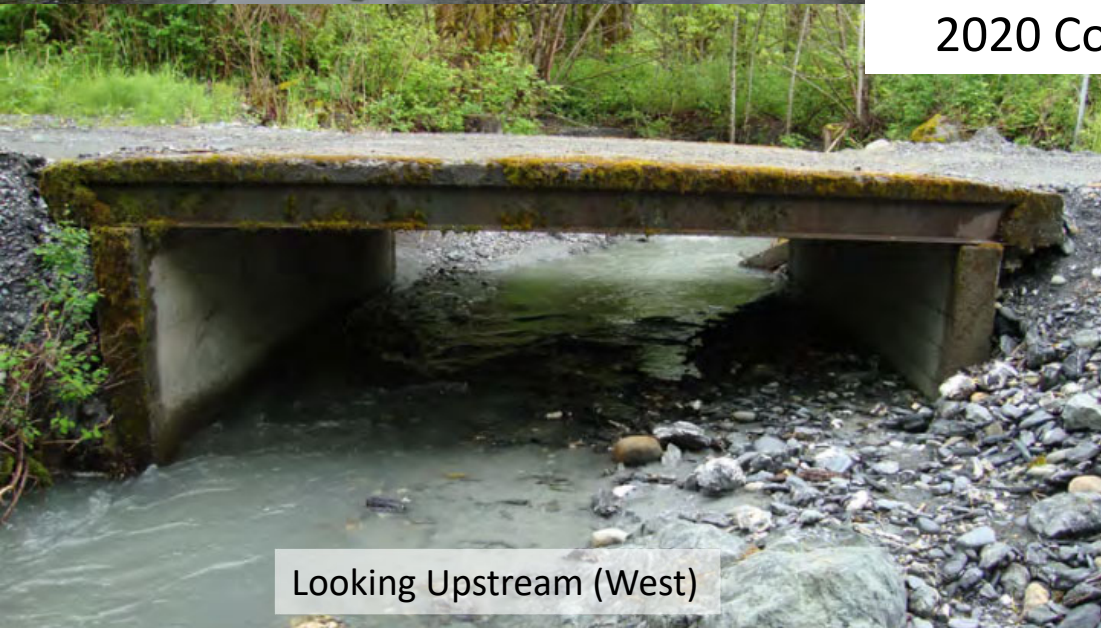
Looking Upstream (West)