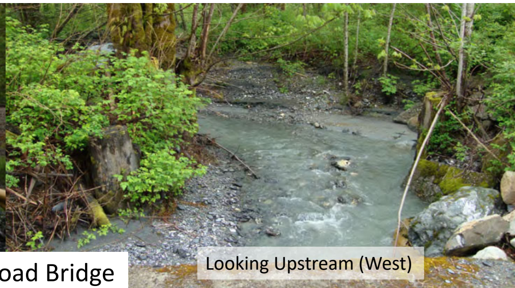
Looking Upstream (West)