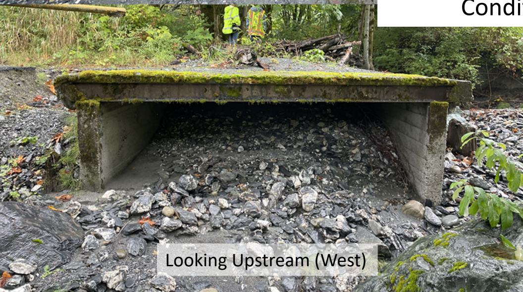
Looking Upstream (West)