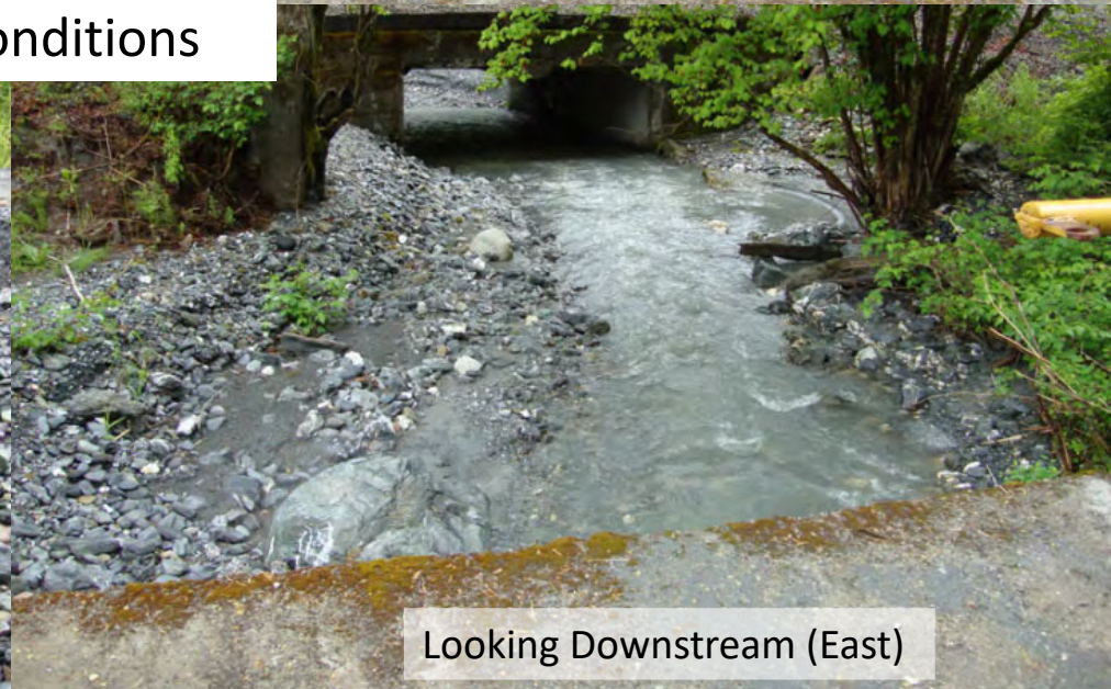
Looking Downstream (East)