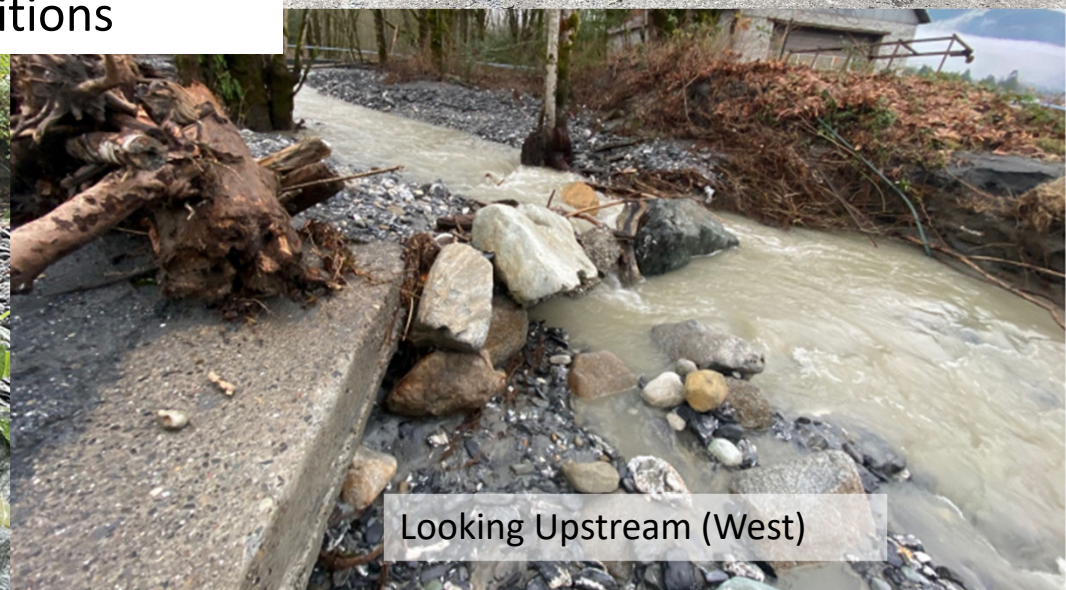
Looking Upstream (West)