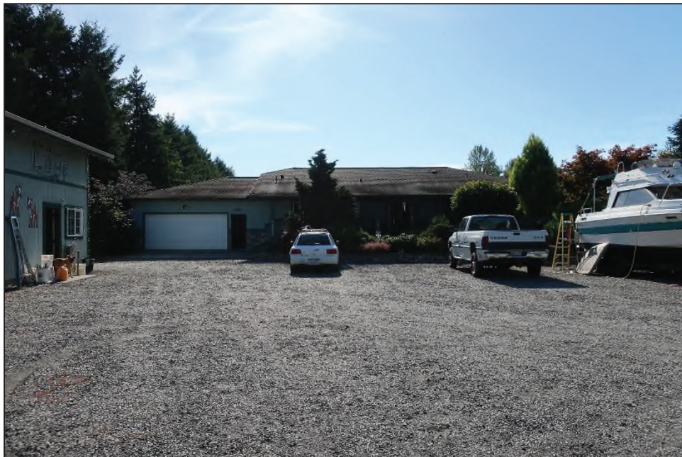
REARVIEW OF RESIDENCE WITH ATTACHED GARAGE, SHOP STRUCTURE ON THE LEFT