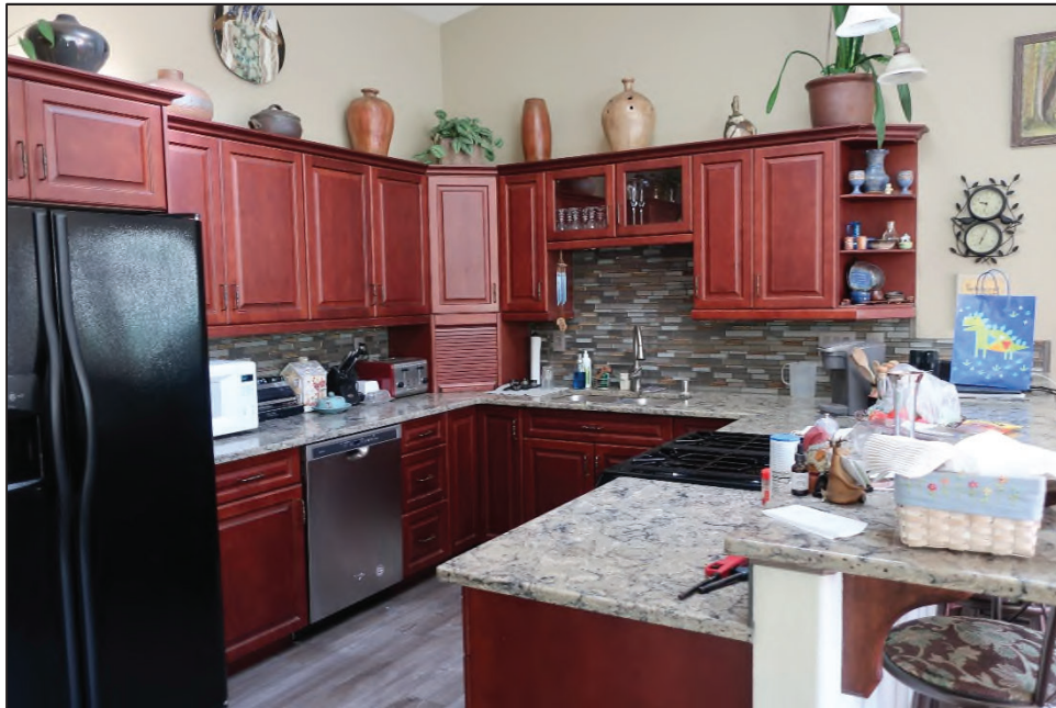
RECENTLY REMODELED KITCHEN AREA