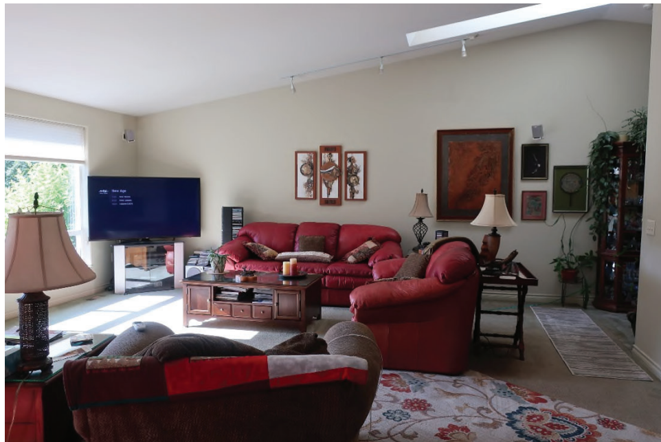
MAIN LIVING AREA