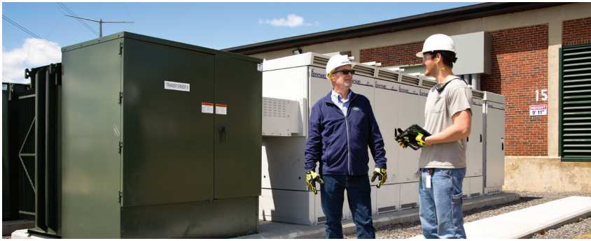
NextEra Energy Resources employees at the 16.2-MW Casco Bay Energy Storage Facility in Maine (April 2017). The company is developing additional energy storage facilities across North America.