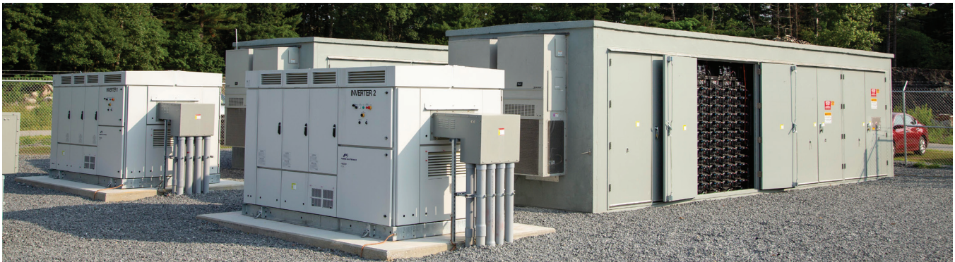
NextEra Energy Resources' Minuteman Energy Storage Facility in Massachusetts went into service in 2019. It provides 5 MW of energy storage.