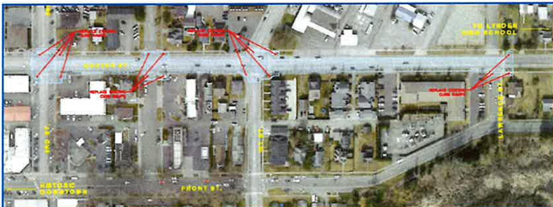
This aerial shows the proposed project area, including the intersections (in red) to be upgraded to current ADA standards.

Solution: A structural overlay in this area will improve one of the most important stretches of the Lynden street network. The project will extend the pavement life, improve traffic flow, and upgrade the pedestrian facilities to current ADA standards. Additionally, the traffic loops will be replaced and upgraded to increase the efficiency of the signals which control the large volume of vehicles travelling through the two signalized intersections in this section.