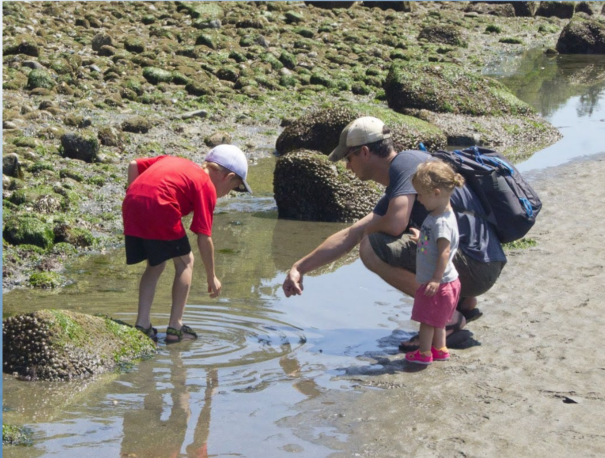
Family at "What's the Point" low tide event