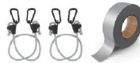
Bungee Cords (2) or heavy-duty tape