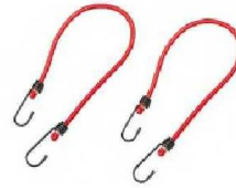
Bungee Cords (2)