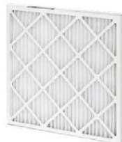
20"x20" Air Filter (Merv 13 or FPR 10)