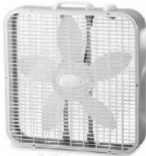
24" Box Fan

Follow these instructions to assemble your DIY Air Cleaner kit. Kit contents include: