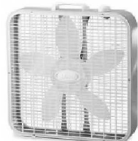
20" Box Fan (made in 2012 or newer)