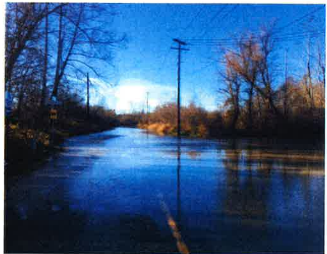
Marine Drive Flooding