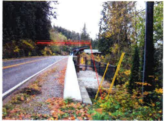
Lake Whatcom Blvd. Location

Contractor: TBD Total cost $26,000 Start: late summer 2019