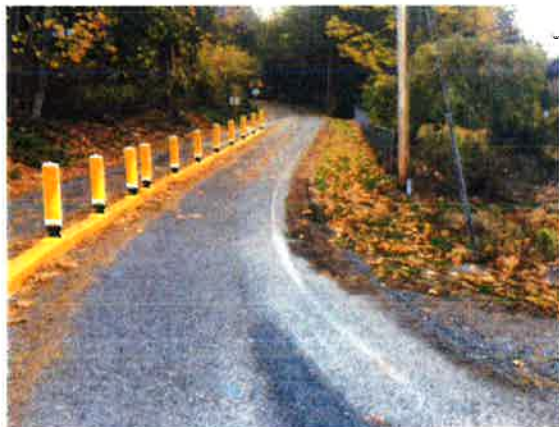
Completed Yacht Club Quiet Zone