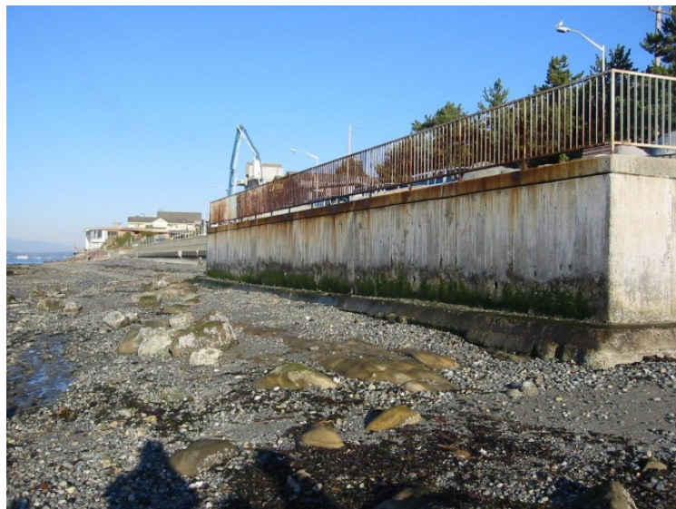
Figure 4-3: The linear length or area of bulkheads may be used as an indicator of no net loss of shoreline ecological functions.

Measuring and continuing to track these indicators can give you a picture of shoreline conditions and ecological functions. The indicators can be measured to track loss or gain. For example, the length of shoreline stabilization may increase or decrease, or the acreage of riparian vegetation may increase or decrease. As conditions change over time, you may need to make changes to your SMP if tracking the indicators shows that your community is not achieving “no net loss” of shoreline ecological functions.