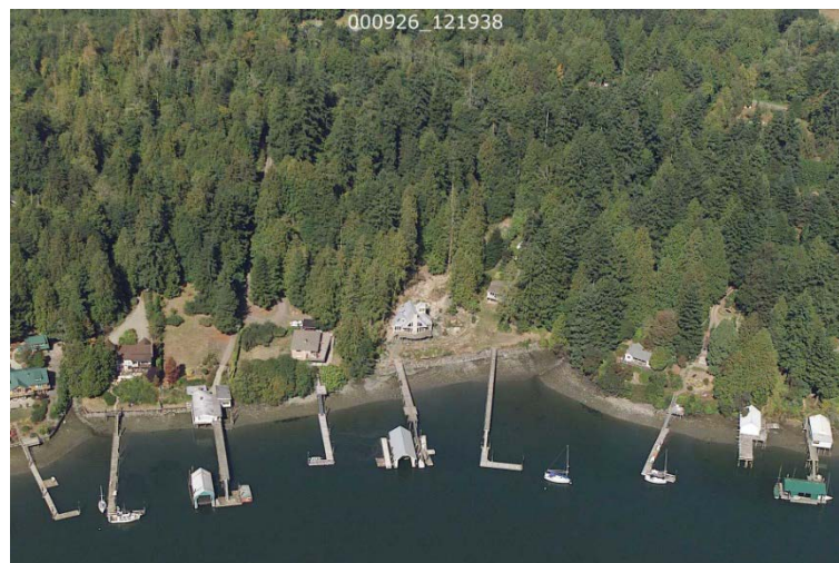
Figure 4-4: Riparian vegetation, overwater structures and impervious surfaces are potential indicators of no net loss.

The indicators you choose should take into account the anticipated future development along your shorelines. Projecting “reasonably foreseeable future development and use of the shoreline” is part of the Cumulative Impacts Analysis. If you expect that urban, suburban or high intensity development will occur along the shoreline, consider indicators related to such development. These may include impervious surface area, shoreline stabilization, overwater structures, riparian vegetation, road lengths or invasive species, among others.